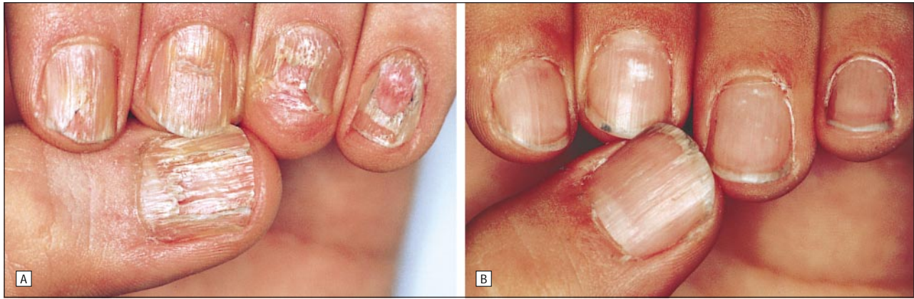
Figure 7. A, Nail lichen planus in a 7-year-old boy (patient 5). Severe nail matrix involvement with nail plate thinning, fissuring, and splitting. B, Complete cure 6 months after the beginning of treatment with triamcinolone acetonide, 0.5 mg/kg every 30 days.

Although the clinical features are highly suggestive, pathological examination is required to confirm the diagnosis. Differential diagnosis includes nail changes caused by graft-vs-host disease, lichenoid drug reactions, nail scarring after Stevens-Johnson syndrome, nail matrix trauma, and lupus erythematosus. 16