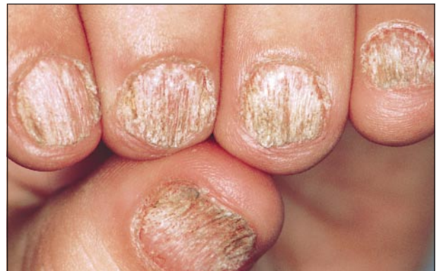
Figure 5. Twenty-nail dystrophy (trachyonychia) caused by lichen planus in a 9-year-old boy.

Twenty-nail dystrophy (trachyonychia) is a clinical entity characterized by nail roughness caused by excessive longitudinal ridging. The condition may involve all 20 nails or be limited to 1 or several digits. Since 1986, we have obtained biopsy specimens from 13 children with 20-nail dystrophy and diagnosed 2 cases of NLP among them. The pathological findings of the other 11 cases showed spongiotic changes in 10 and psoriasis in 1.