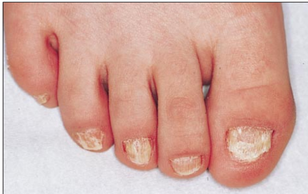
Figure 2. Nail lichen planus in a 10-year-old boy (patient 10). The toenails show nail thinning with longitudinal striations caused by severe nail matrix involvement.