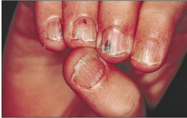
Figure 1. Nail lichen planus in an 8-year-old boy (patient 7). The nail plate is thinned and shows mild longitudinal ridging with distal splitting. Nail bed involvement with onycholysis is also present.