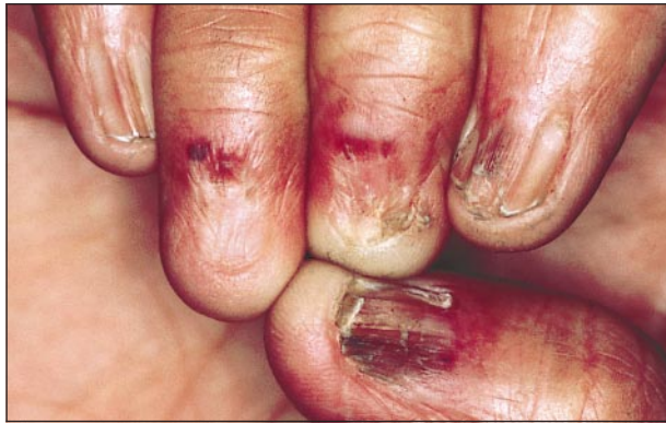
Figure 6. Idiopathic atrophy of the nails in a 12-year-old Indian girl.

bandlike lymphocytic infiltrate with vacuolar degeneration of basal keratinocytes.