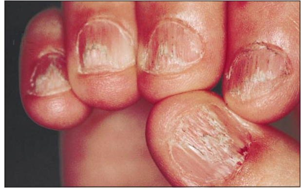
Figure 3. Nail lichen planus in a 12-year-old girl (patient 4). Note severe nail matrix involvement of the thumb with onychorrhexis and partial nail plate destruction. The other digits show mild ridging caused by matrix involvement and distal onycholysis caused by nail bed involvement.